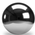
Acero Inoxidable Tipo 304 y 316

Si la tela que necesitas no la encuentras en nuestras tablas, consúltanos y con toda seguridad podremos satisfacer tus necesidades.